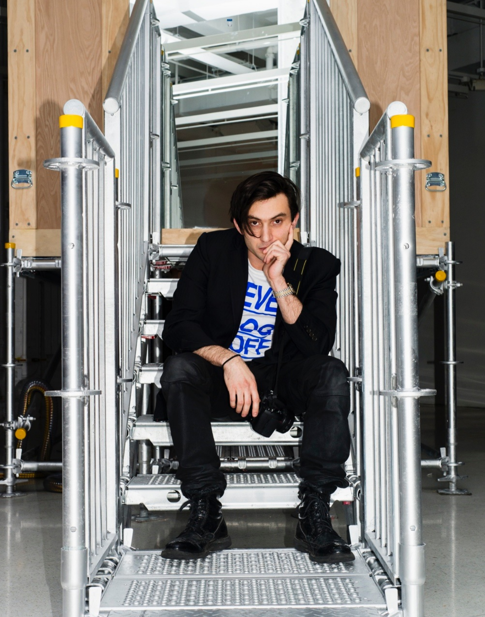
Photo of artist on the steps of the upstairs sculpture.