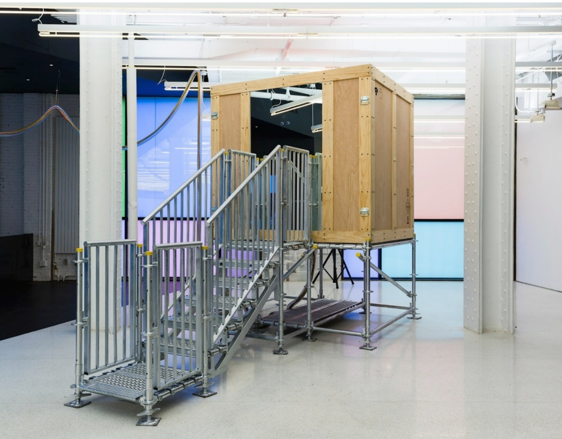
Upstairs viewing box - a reimagined version of Duchamp's Étant Donnés for the internet age. The content comes from 6 users in a sculpture downstairs. This is a representation the feed.